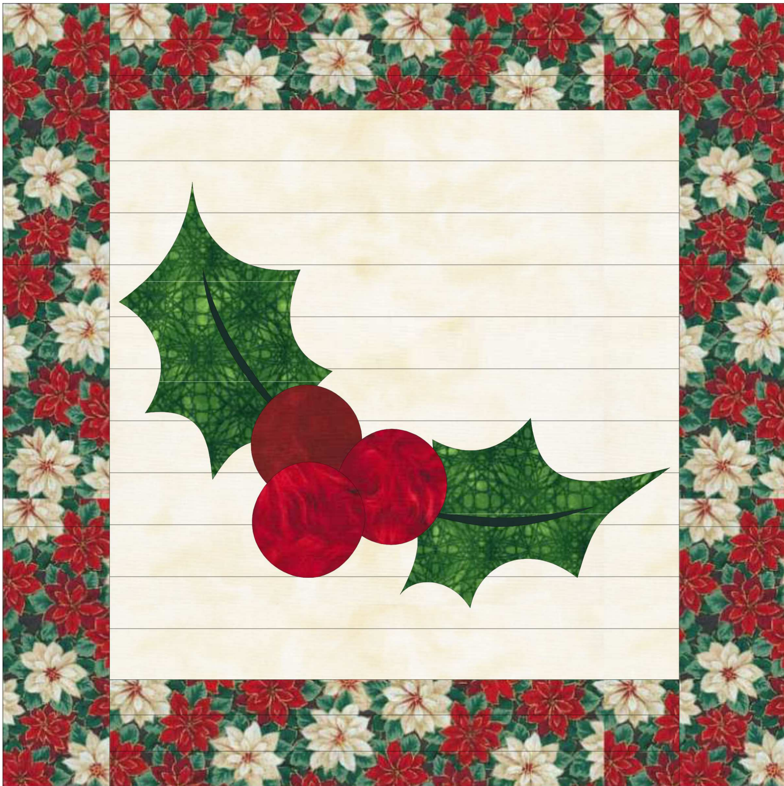
Christmas Holly, 11" by 11" Compliments Of Jenny Kae Quilts 2016